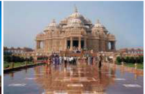
Swaminarayan Akshardham Temple