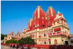
Lakshminarayan Birla Mandir