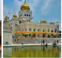
Gurudwara Bangla Sahib