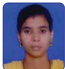
Nutan Ward Aaya Housekeeping