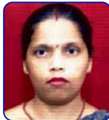
Sanju Ward Aaya Housekeeping